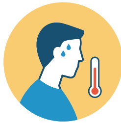
FEVER 100.4* OR CHILLS

*or school board policy if threshold is lower