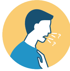
NEW LOSS OF TASTE OR SMELL

*particularly new onset of severe headache, especially with fever