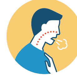
SHORTNESS OF BREATH OR DIFFICULTY BREATHING