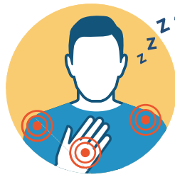
MUSCLE OR BODY ACHES OR FATIGUE