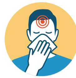
CONGESTION OR RUNNY NOSE